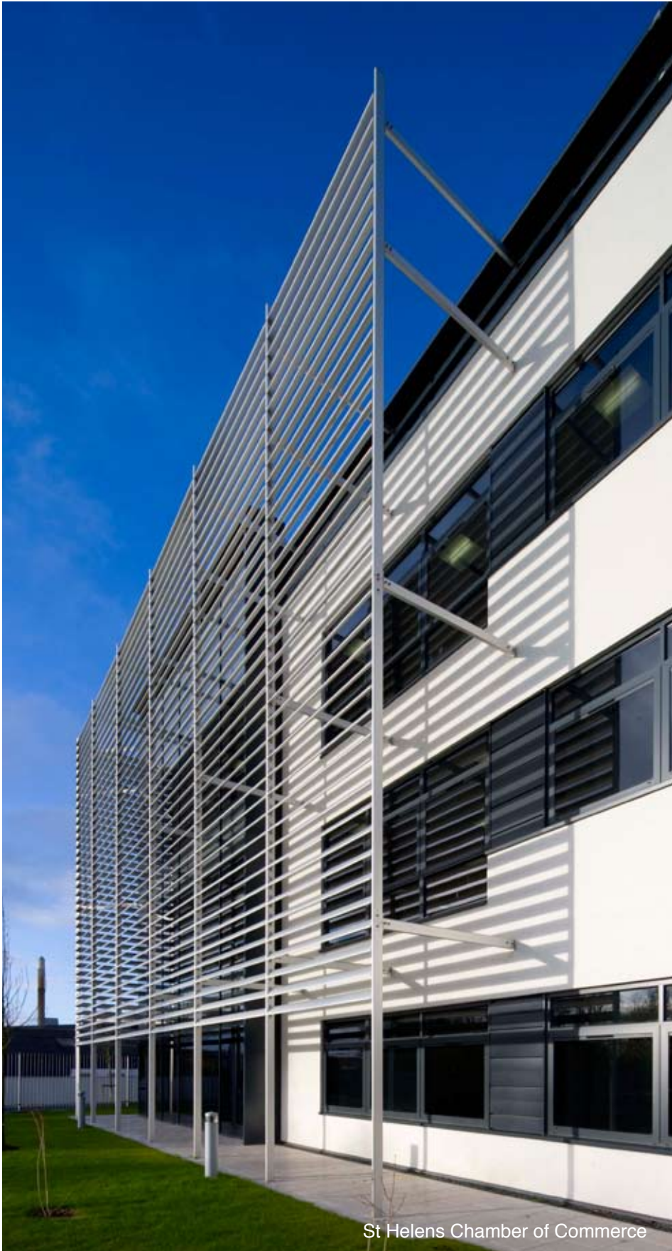
St Helens Chamber of Commerce