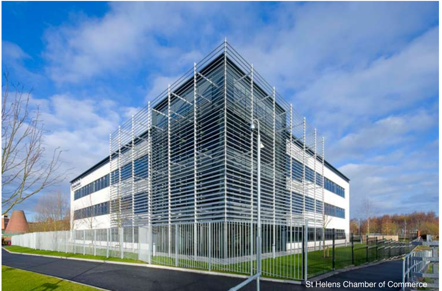
St Helens Chamber of Commerce