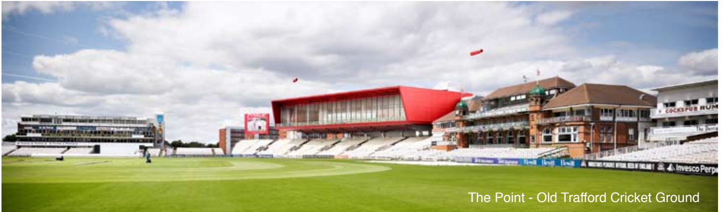
The Point - Old Trafford Cricket Ground